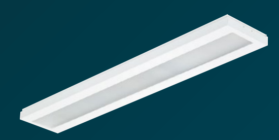
CoreLine surfacemounted luminaire